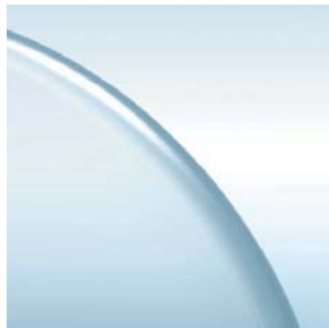
Customized edge processing and bored holes